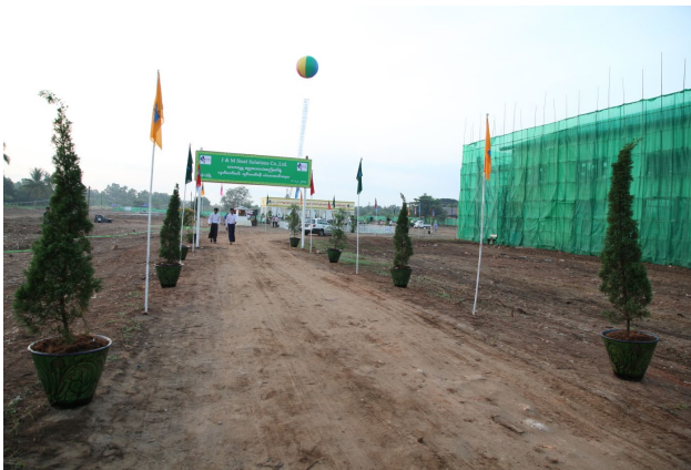
■ Site for the plant