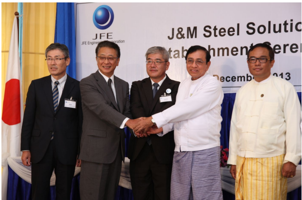
■ Company establishment ceremony held on December 1.