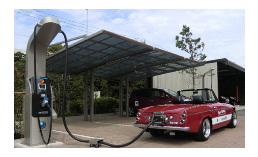
Test vehicle during super rapid charging

At left: The Super RAPIDAS charging stand, which is equipped with 2 types of charging connectors, enabling both super rapid charging and rapid charging.